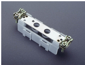
03 620 neutral conductor 160 A cleat, both sides