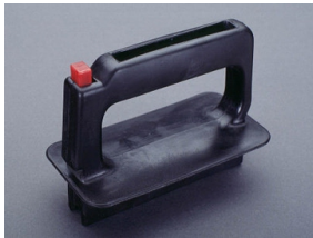
03 502 NH fuse extractor handle open size 000 - 3