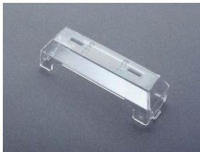
79 448 grip lug cover for NH base and 33 705 NH 00