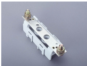
03 519 neutral conductor 160 A screw, both sides